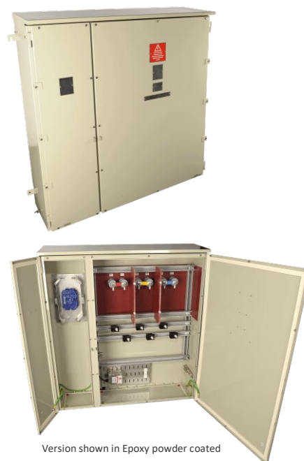
Version shown in Epoxy powder coated